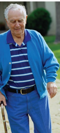
Brochure designed by elsmoresocialcare.co.uk